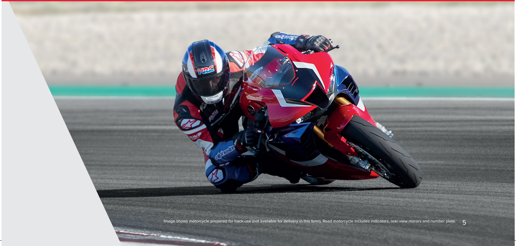
Image shows motorcycle prepared for track use (not available for delivery in this form). Road motorcycle includes indicators, rear view mirrors and number plate.